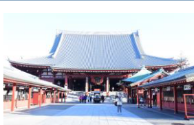
🏯 Senso-ji Temple

Icons: 🏯 Shrines and Temples 🌳 Park 🏠 Other