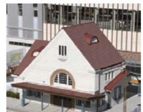
Restored triangular station building of the former Kunitachi Station

Hikari-cho, Kokubunji City The name of the town changed from Hambee Shinden to Hikaricho in honor of the development of the Shinkansen Hikari.