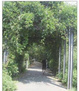
8 Pergola made of railroad rails installed in the arch of the green way

Green walkway Leads to Imokubo-kaido Road There used to be a railroad sidetrack that led to Tachikawa Airfield