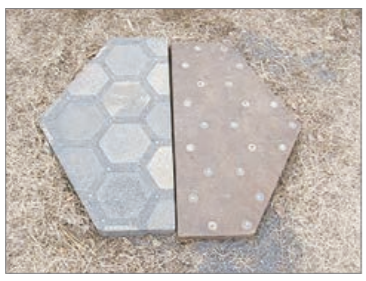
The Navel of Tokyo

9 Kita-daiichi Park has health equipment for strength training and stretching